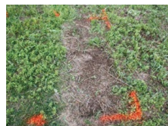
Oxalis Sublime (14 DAT)