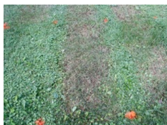
Ground ivy Sublime (14 DAT)