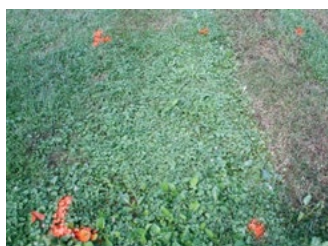
Ground ivy Untreated check (14 DAT)