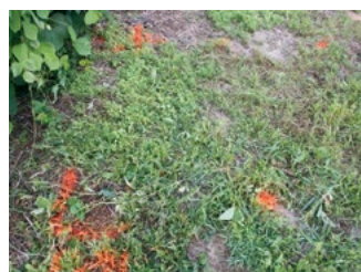
Oxalis Untreated check (14 DAT)